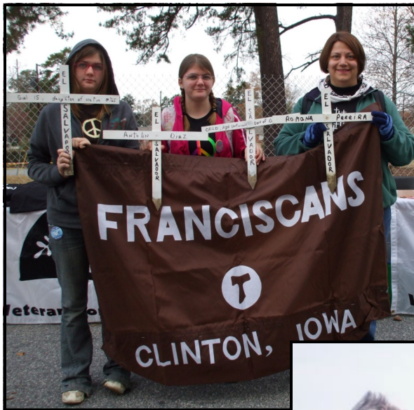
Students join Clinton Franciscans at SOA protest.